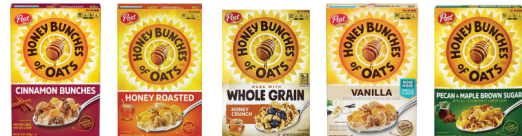
Honey Bunches of Oats with Cinnamon Bunches