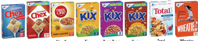
Blueberry Chex Cinnamon Chex Fiber One Honey Clusters Kix Berry Berry Kix Honey Kix Total Wheaties