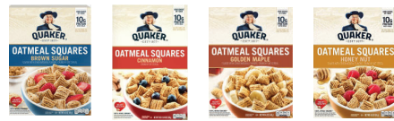
Oatmeal Squares Brown Sugar