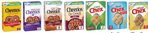
Cheerios MultiGrain Cheerios Vanilla Spice Cheerios Oat Crunch Berry Cheerios Corn Chex Rice Chex Wheat Chex