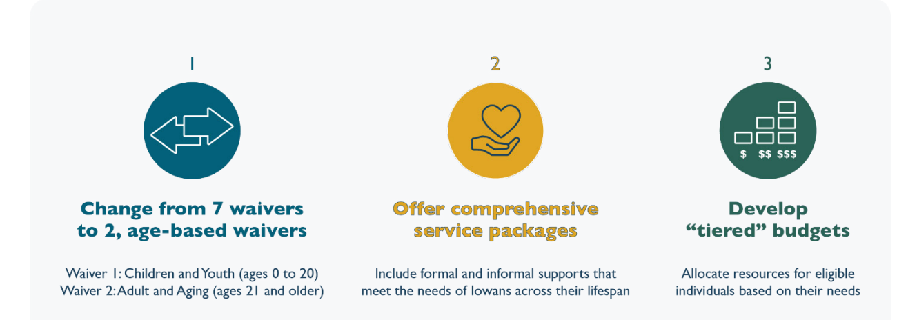
Figure 3. Three proposed changes to the HCBS waiver system