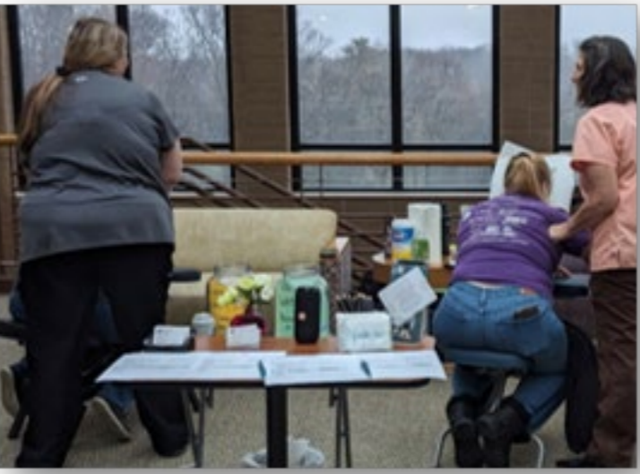
Iowa Caregivers Retreat