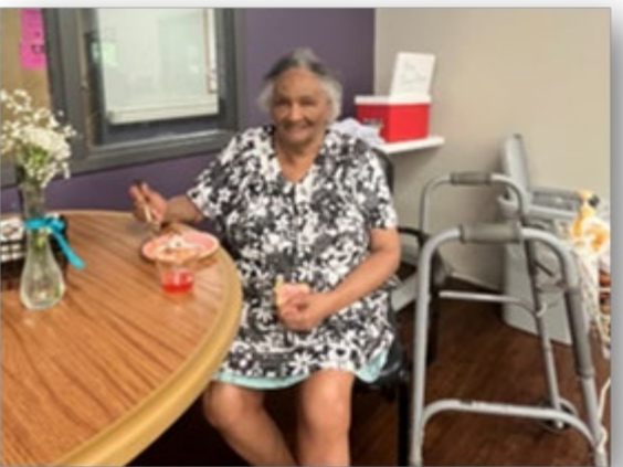
Nursing Home Week & Mother's Day