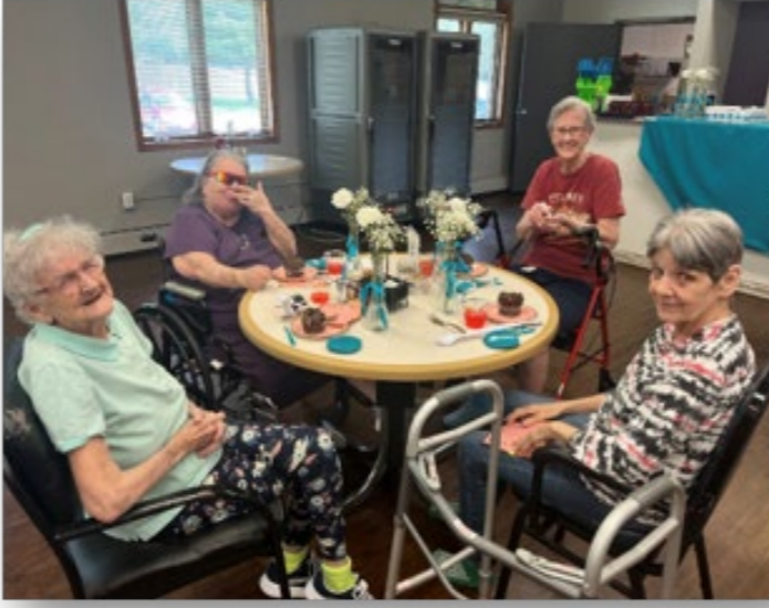
Nursing Home Week & Mother's Day