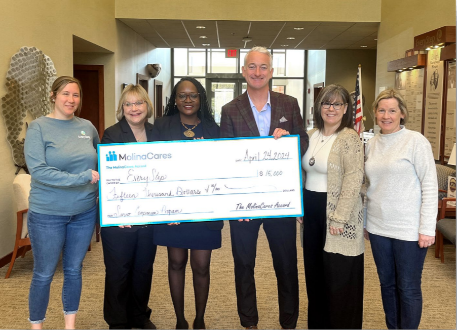
Molina Healthcare of Iowa Makes $15,000 Donation to Support EveryStep’s Senior Companion Program