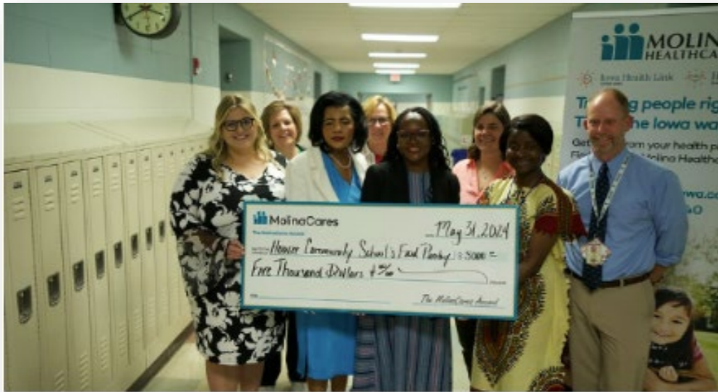
Molina Healthcare of Iowa Donates $5,000 to Support Elementary School Food Pantry