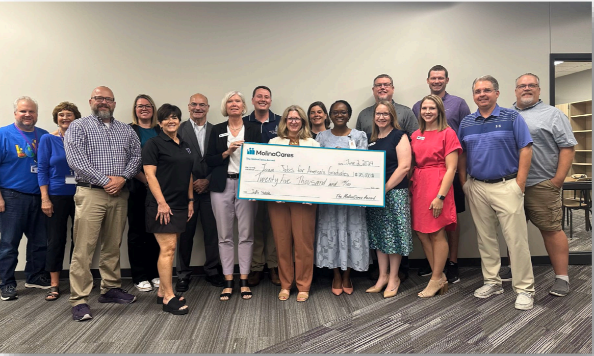
Molina Healthcare of Iowa to Donate $25,000 in Support of the Iowa Jobs for America’s Graduates (iJag)