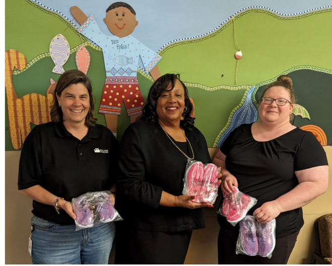
Shoe Giveaway at Children & Families of Iowa