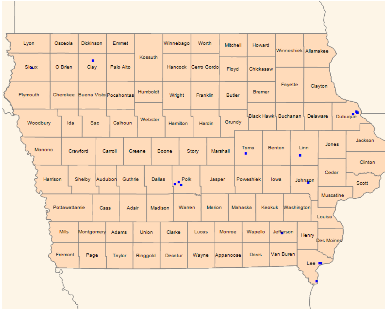
Table 1B Map: Waiver – Health & Disability - Counseling Services – Rural - 30 minutes or miles: Less than 100% standard