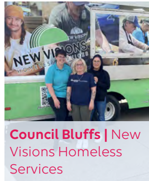
Council Bluffs | New Visions Homeless Services