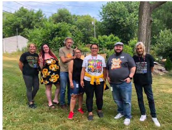
Pictured: Wellpoint Iowa was invited by Humility Homes to be part of a homeless immersion project. People who have faced and who were currently facing homelessness led a walk throughout Davenport, highlighting the many challenges of what it's like to be homeless.