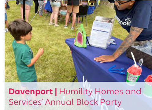
Davenport | Humility Homes and Services' Annual Block Party