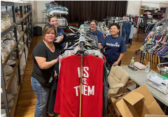
Pictured: Members of Wellpoint's LTSS case management team volunteer to help sort clothing and other shelter donations at Humility Homes.

Mission: Humility Homes & Services, Inc. is committed to ending homelessness by offering housing opportunities and supportive services in the greater Quad Cities area.