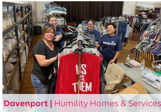
Davenport | Humility Homes & Services