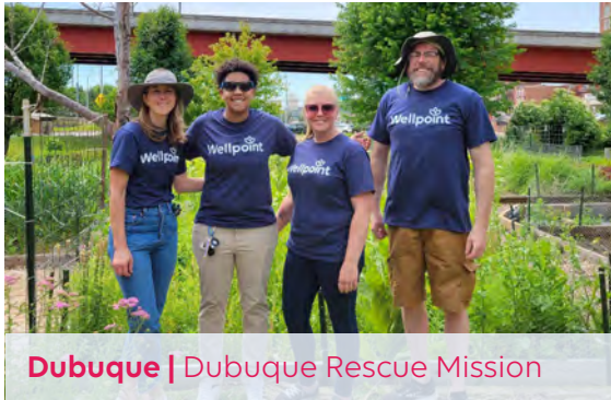
Dubuque | Dubuque Rescue Mission