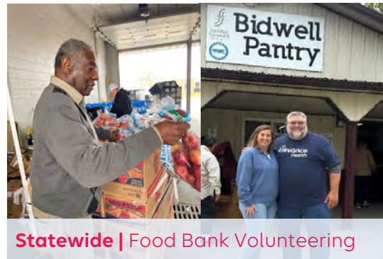
Statewide | Food Bank Volunteering