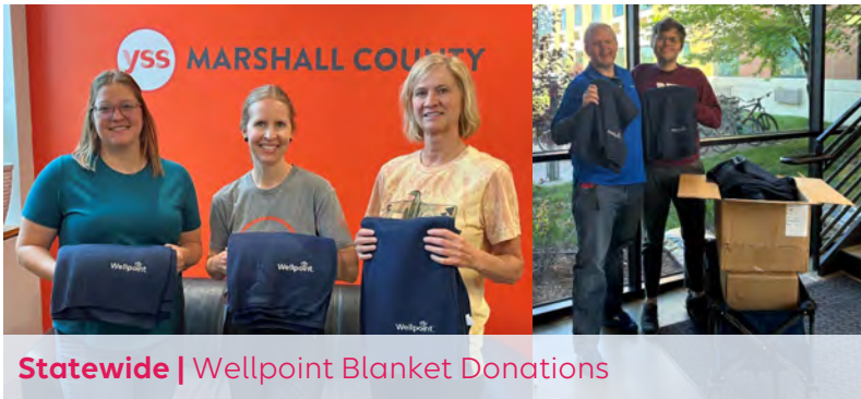
Statewide | Wellpoint Blanket Donations