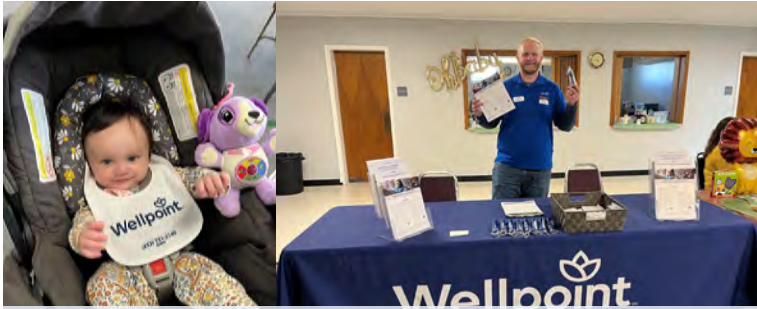
Statewide | Community Baby Shower Sponsorships