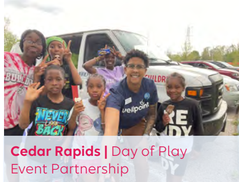
Cedar Rapids | Day of Play Event Partnership