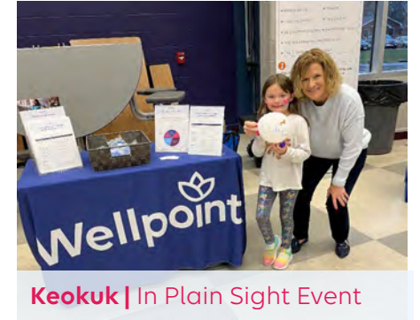
Keokuk | In Plain Sight Event