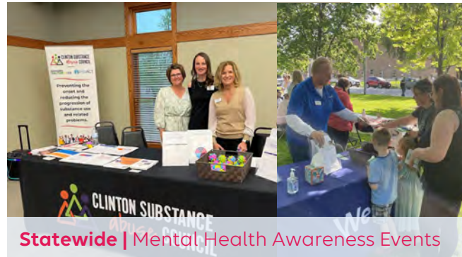
Statewide | Mental Health Awareness Events