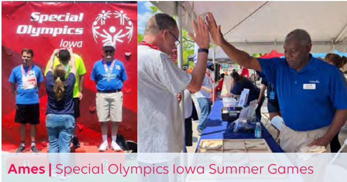
Ames | Special Olympics Iowa Summer Games