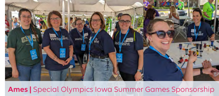
Ames | Special Olympics Iowa Summer Games Sponsorship