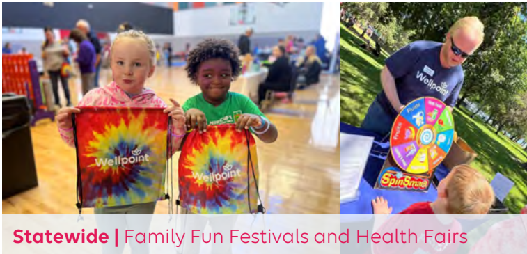
Statewide | Family Fun Festivals and Health Fairs