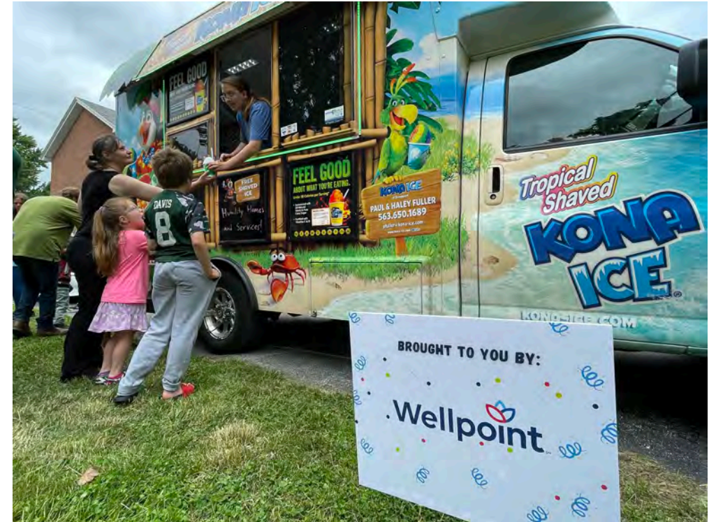
Pictured: Wellpoint Iowa sponsored Humility Homes' open house and annual block party event, bringing people experiencing homelessness and the neighborhood around the shelter together. Wellpoint sponsored the Kona Ice truck that was able to help keep everyone cool on the warm summer day.