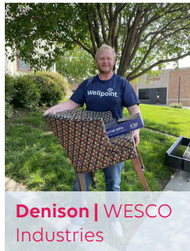
Denison | WESCO Industries