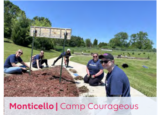
Monticello | Camp Courageous