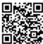
QR link to Child Care Data Dashboard

For child care programs, join HHS on one of the dates and times below for a demo of the Child Care Search and Child Care Data Dashboards.