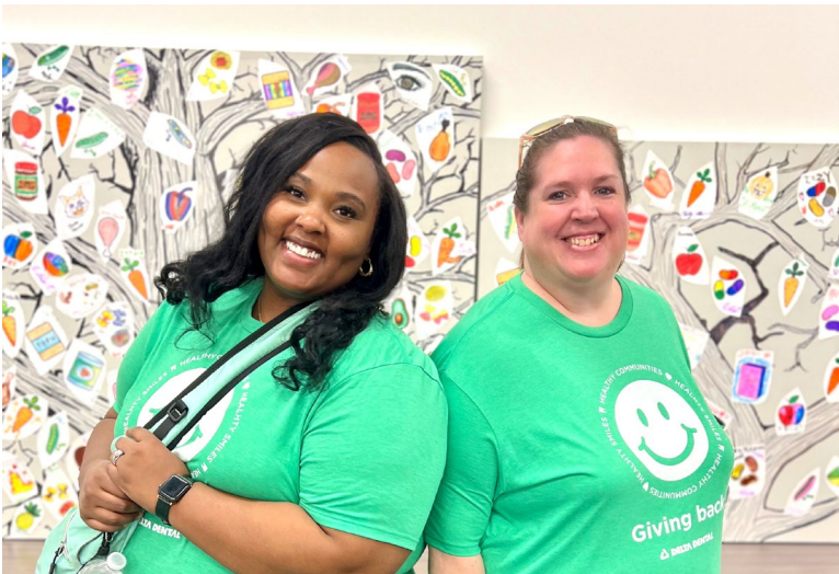
Des Moines Area Religious Council Stamp Out Hunger

Community Impact Hours - Employees receive 8 hours of paid CIH each calendar year to volunteer with an organization of their choice.