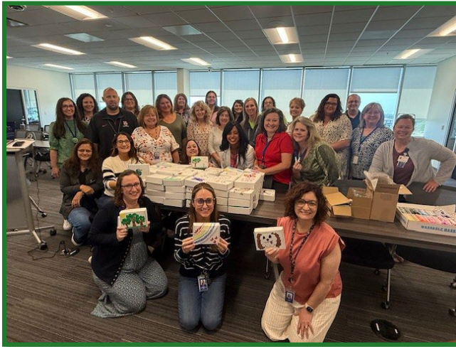
Easterseals Iowa: Kids Care Kits