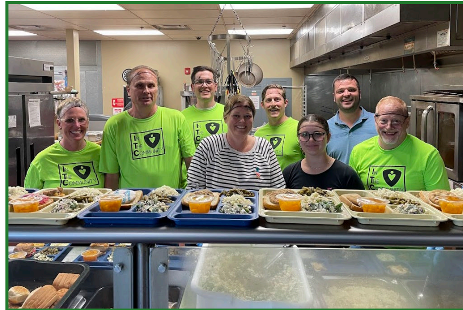
Central Iowa Shelter & Services: Lunch Service