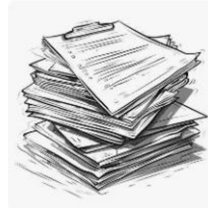
Case Manager Notes (Psych/Social History)