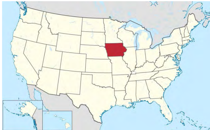
Iowa's location within the United States.