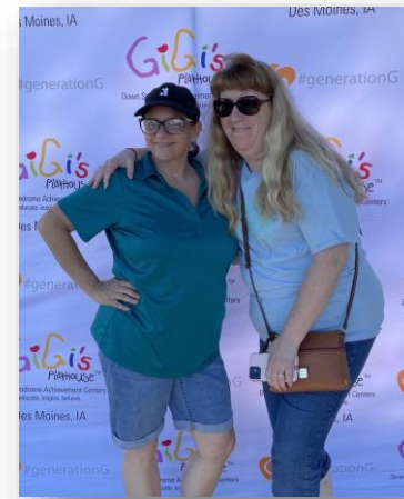
Gigi Fit 5K