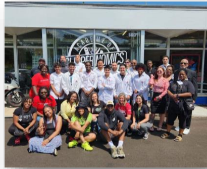
Mane & Maintain: A Gentleman's Grooming and Wellness Day