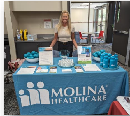
Future Fest Resource Fair