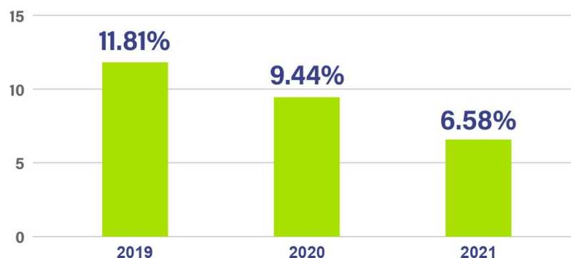
SNAP Error Rate

DHS has significantly improved the State's SNAP Error Rate over the past two years. In 2019, the Error Rate was 11.81%. In 2020 it was 9.44%. In 2021 it was reduced to 6.58%.