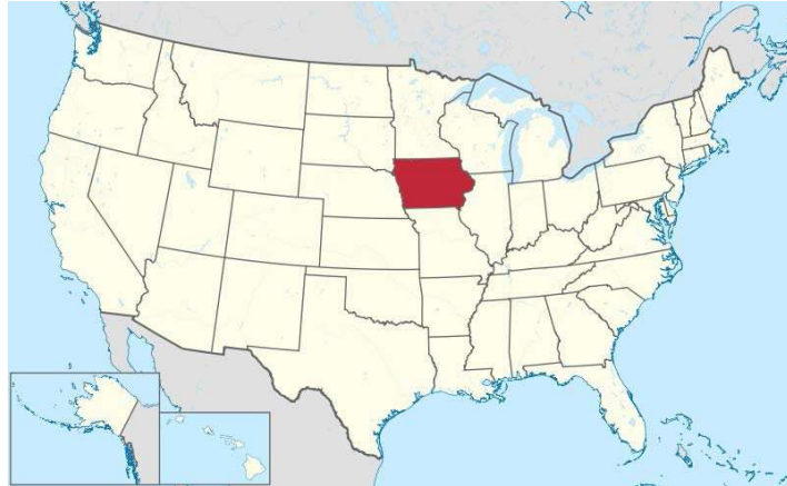
Iowa's location within the United States.