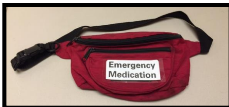
"Fanny" Hip Pack

A "fanny" hip pack or small cooler is best for outdoor play or field trips